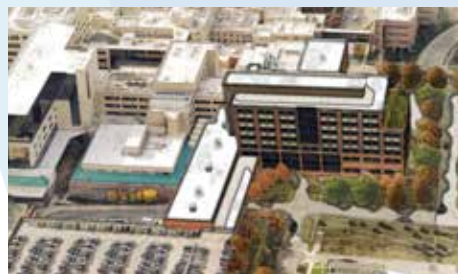
Rendering of Family Birth and Children's Center

The Next Chapter of care continues at Munson Medical Center with ongoing plans for the construction of the new Family Birth and Children's Center.