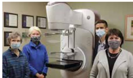
Celebrating the addition of 3D Breast Imaging technology at Paul Oliver Memorial Hospital.

Breast cancer is the most common invasive cancer in women with one in eight women in the United States diagnosed within their lifetime. Early detection and advancements in screenings are key factors in diagnosis and improving outcomes—now, you have access to advanced 3D breast imaging at Charlevoix and Paul Oliver Memorial Hospitals.