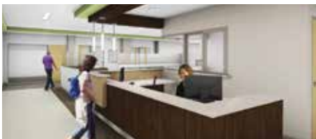
Rendering of renovation and expansion project.

In September, 2016, Otsego Memorial Hospital announced the launch of a major project to renovate and expand its Emergency Department, Surgical Services, and Ambulatory Care Department—a vision that became reality fall of 2020 upon completion of the Building Future Capital campaign project!