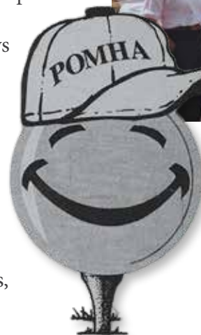
Pictured above, members take to the green for the annual golf benefit at Crystal Mountain Resort.